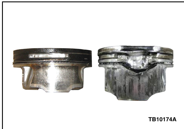
Figure 2 - Article 11-7-7