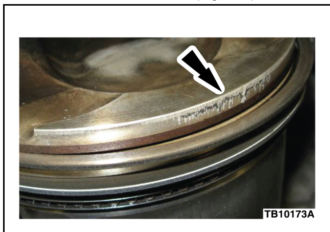
Figure 1 - Article 11-7-7