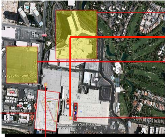
Friends of Ford Registration HQ (North Hall)